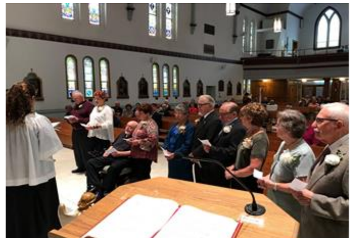
50 th & 60 th Wedding Anniversaries